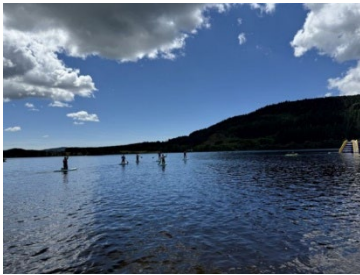
Dumfries & Galloway trip